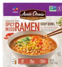
Spicy Miso Ramen