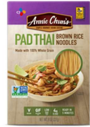
Pad Thai Brown Rice

Chef Woo's and "Chef Ramsey's Chef Woo" noodles are all certified vegan (available at Wal Mart)