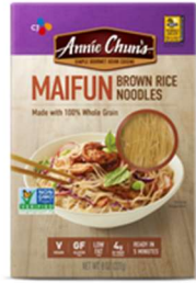
Maifun Brown Rice