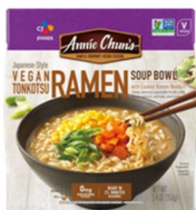
Vegan Tonkotsu Ramen